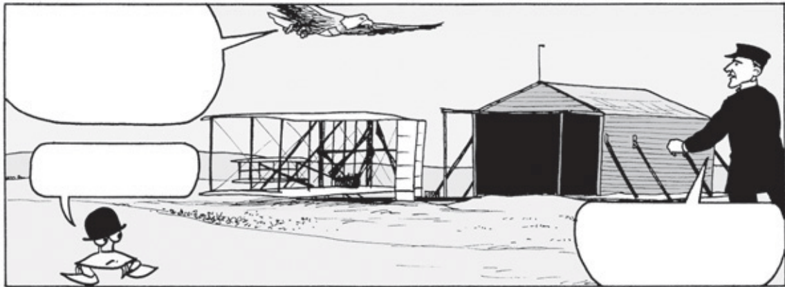
ORVILLE CLIMBS ABOARD. THE "WRIGHT FLYER" CLATTERS DOWN A 60-FOOT RAIL.

WILBUR AND ORVILLE WRIGHT RETURN TO KILL DEVIL HILLS, NORTH CAROLINA, IN 1903. THEY HAVE A GLIDER WITH A MOTOR THEY BUILT THEMSELVES IN THEIR BICYCLE SHOP IN DAYTON, OHIO.